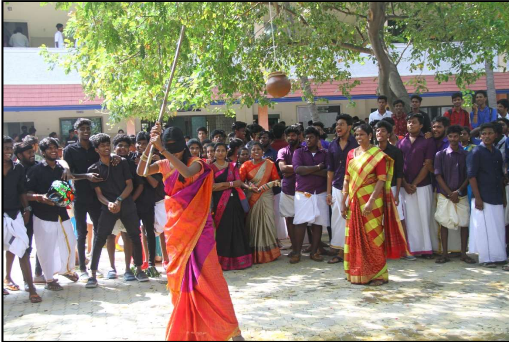
Traditional Game- Uri Adhithal or pot breaking blindfolded