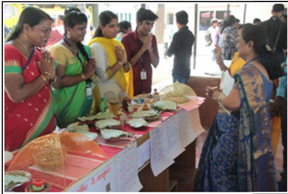
Language Department exhibiting the Nutritious food