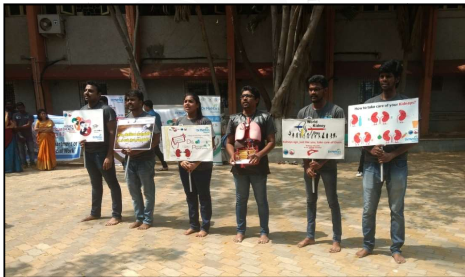
Social work students performing a street play on World Kidney Day