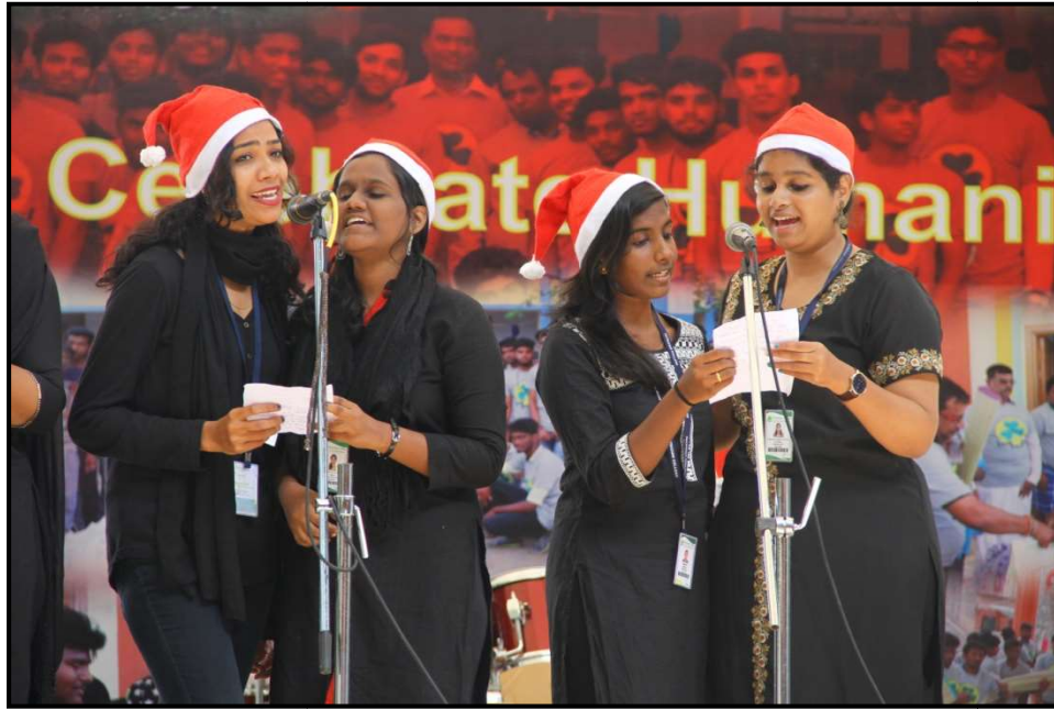
Christmas Carol Competition for Students