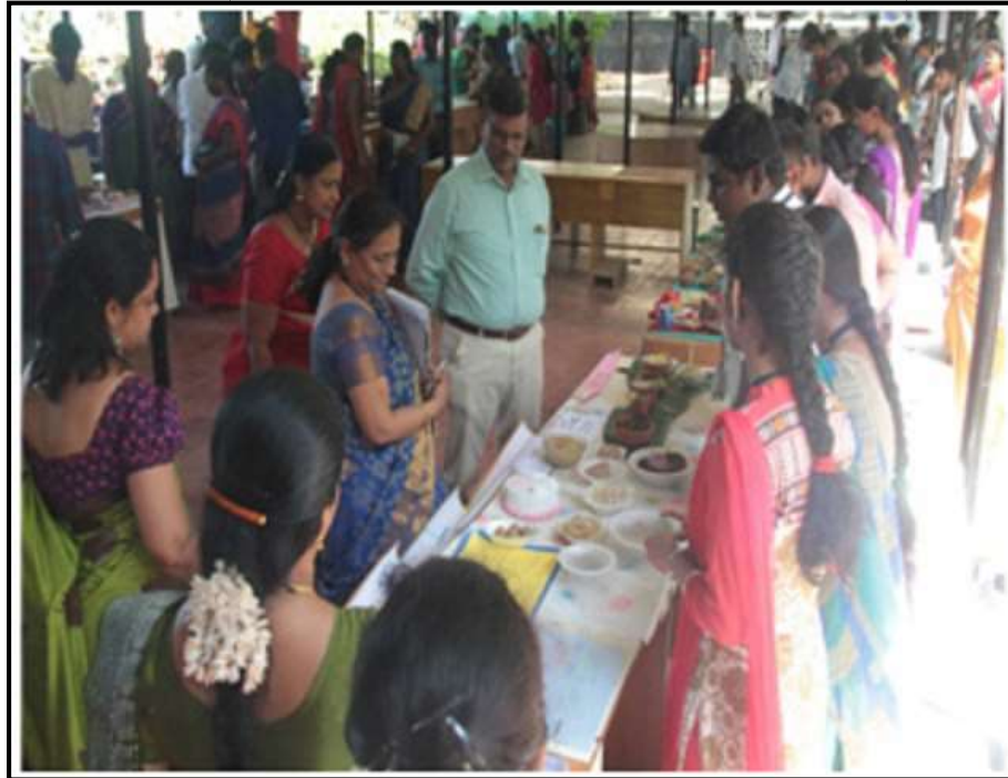
Computer Science Department exhibiting the Nutritious food