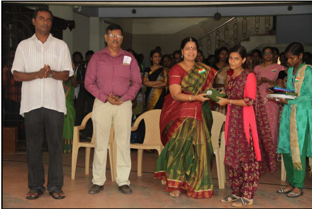
Prize Distribution on Independence Day