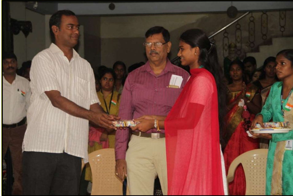
Winner of a competition being awarded with prize