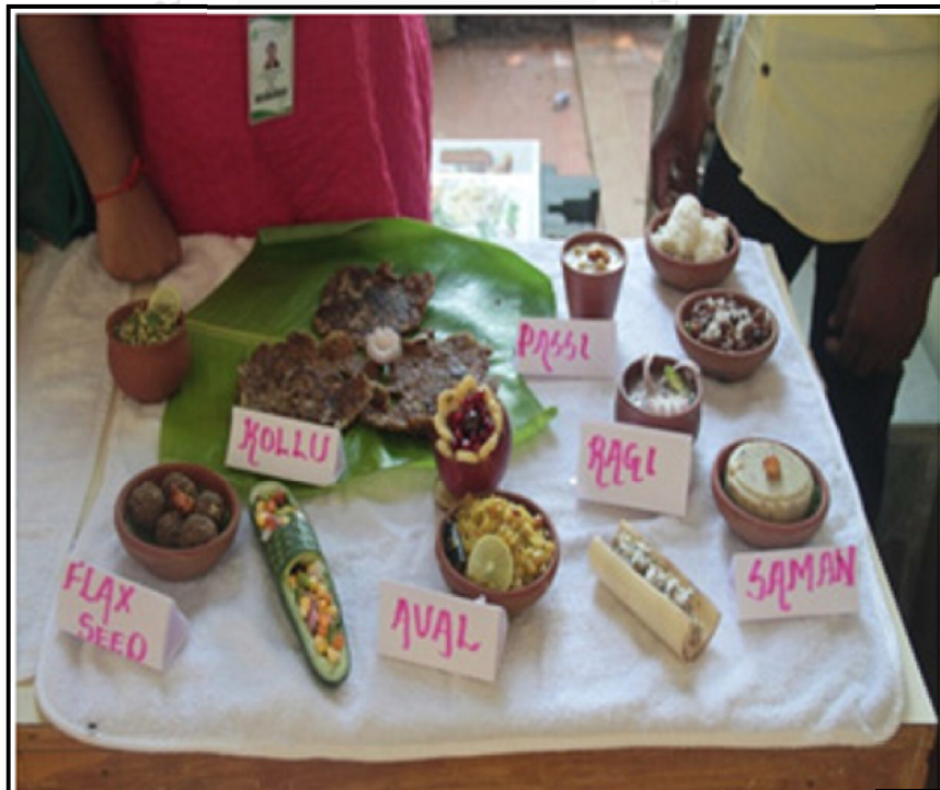
A exhibit of Traditional Nutritious food made of Millets, Oats, Flax seeds etc...