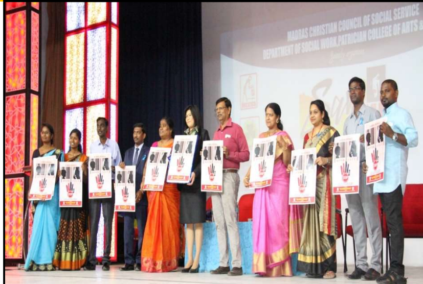
Posters on Anti-Trafficking released by the Council