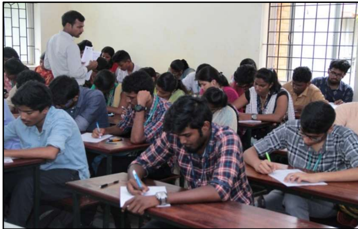
Students actively participating in competitions on the occasion of Independence Day