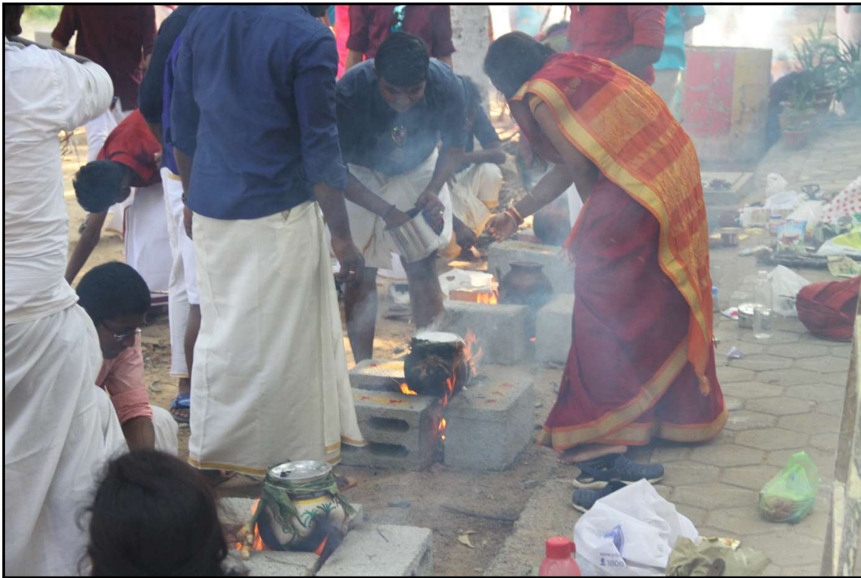
Pongal Preparation by the students

Tamil harvest festival Pongal was celebrated on 12 th January 2018 to remind the students of tradition and culture. Various Traditional art forms like Rongali, Villupattu, Folk Dance, thappattam (drum beating), Silambuattam (martial arts) were performed by the students. Such commemorative events enlivened the spirit of Indianness.