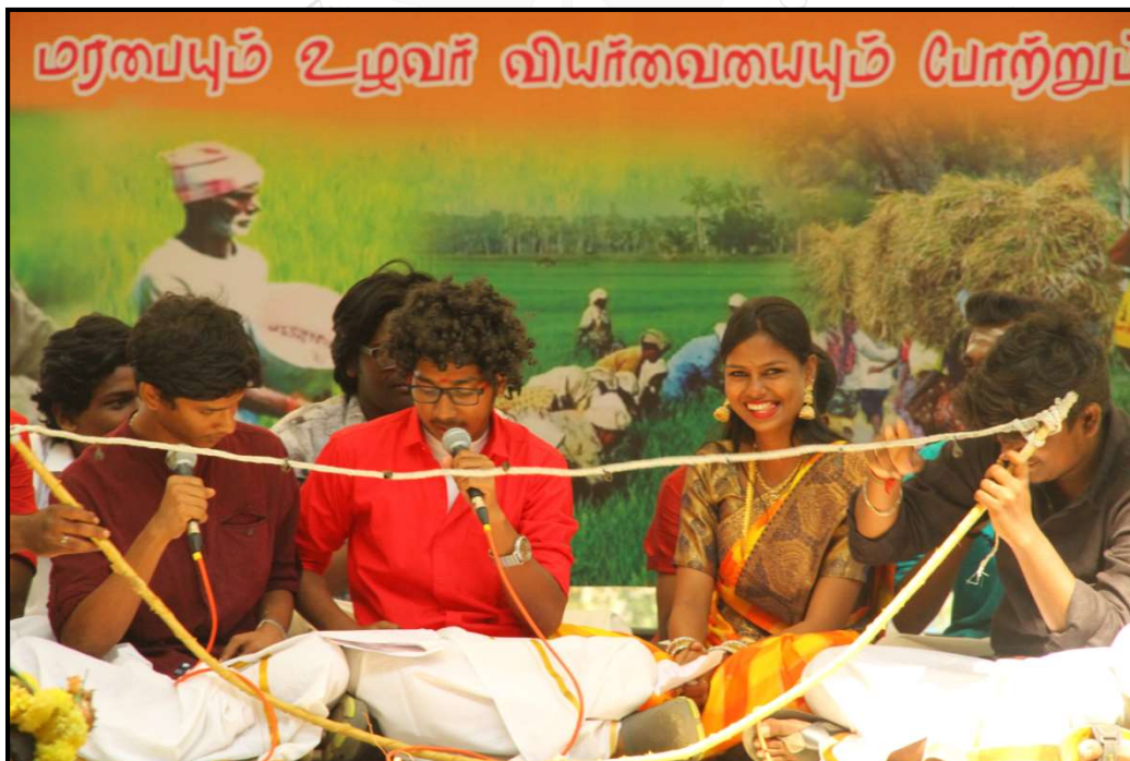
Traditional Villu Pattu (Song with social theme) by the students