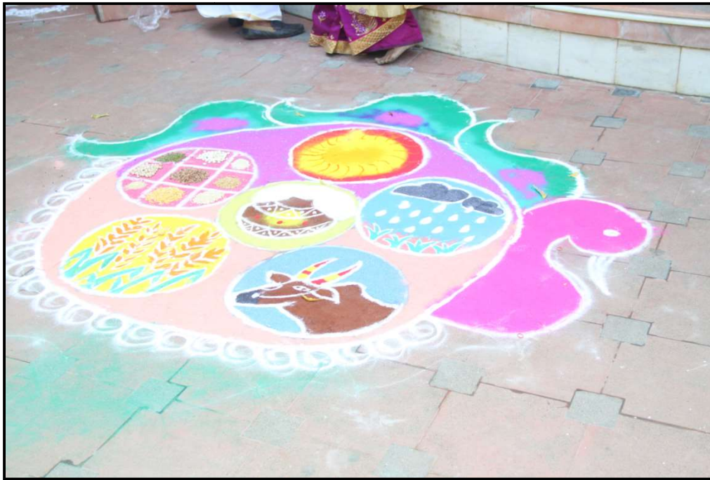
Rangoli Competition on the Village life