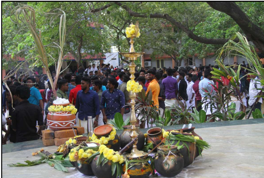
Traditional – Pongal prepared by the students