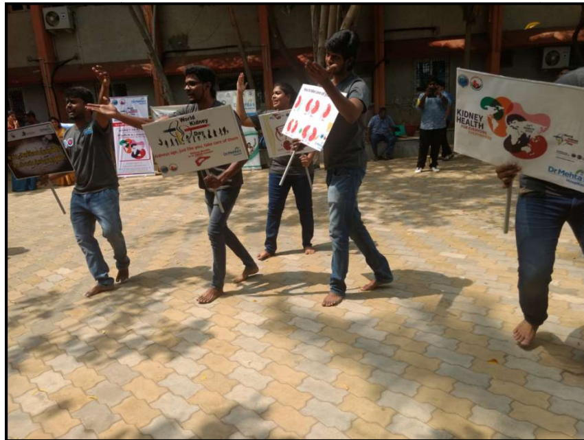
Awareness by Social work students