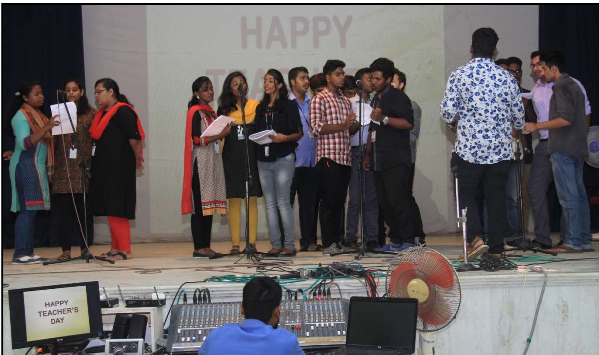
Students entertaining the staff on Teacher's Day