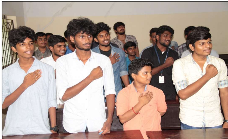
NSS Volunteers taking oath during National Unity Day

Birthday of SardarValabhai Patel, Former Deputy Prime Minister of India, was celebrated as National Unity Day on Wednesday 31st October 2018. 50 NSS Volunteers took part in this event and took a pledge to maintain Peace and Unity in the Nation. The Programme officers of NSS briefed the volunteers on the importance of celebrating National Unity Day.