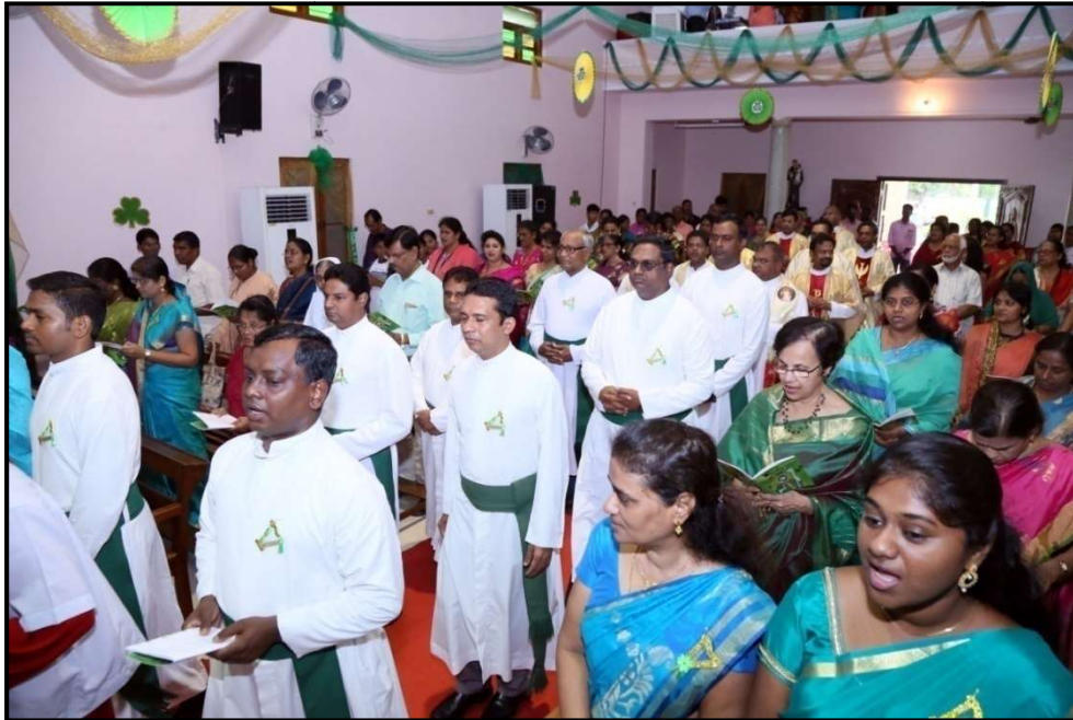
Brothers at the mass on St Patrick's feast day

St. Patrick's Feast Day is the feast of the patron saint of the College. On 9 th March, all the Patrician Brothers were invited for the celebrations.